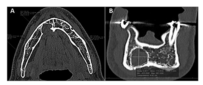
Figure 2. Multislice computed tomography. (A) Axial section showing a lingual bone defect with a slight reduction of the buccal cortical plate and defined corticated margins. Note the value of 19.866 HU for the content compared with the fat areas (–8 HU) adjacent to the lingual cortical plate of the mandible in the posterior region. (B) Coronal section. Observe the extensive bone defect confined to the medullary portion of bone, preserving the base of the mandible.