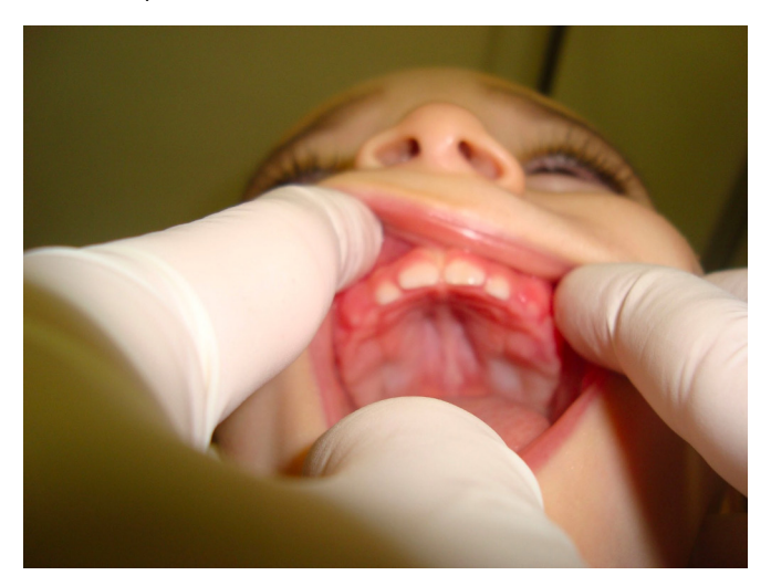
Figure 3. Square palate in preterm infants submitted to invasive mechanical ventilation by orotracheal intubation