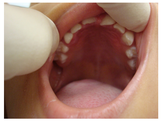
Figure 4. Ovoid palate in preterm infants submitted to invasive mechanical ventilation by orotracheal intubation

However, we were not permitted to use this classification by the Research Ethics Committee of the HU-USP, since this approach was considered too invasive, that is, making molds of the palates could further contribute to the children's emotional trauma, given that they have already undergone numerous manipulations due to being born prematurely.