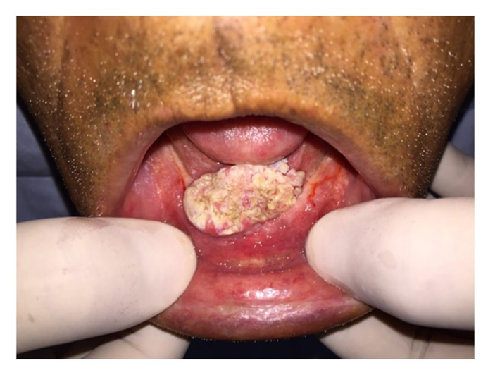
Figure 1. Clinical presentation of the lesion as an extensive painless verrucous leukoplastic lesion, with 40 mm in the largest diameter, located in the mouth floor.

A 78-year-old white male was referred to a private dentistry service with a chief complaint of a white tumor underneath the tongue. Intraoral examinations revealed an extensive verrucous leukoplastic lesion, with 4.0 cm in the largest diameter, asymptomatic, located in the mouth floor (Fig. 1), with 2 months evolution. Anamnesis revealed that the patient worked in farming, was former smoker, and ex-alcoholic. Medical history was noncontributory. The presumptive diagnoses were verrucous carcinoma × benign verrucous hyperplasia × squamous cell carcinoma. Incisional biopsy was performed and the tissue sample was sent to histological examinations.