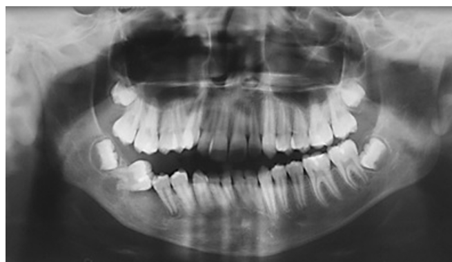
Figure 4. Seven years after corticoids injection, OPG presents tooth roots of units 45 and 47 were still in development stage, with apices open. New bone formation in parasymphysis and mandibular body can be noticed and circumscribed radiolucent area, only associated with the root of dental unit 47 still evident.

It was noted by the OPG that tooth roots were still in development stage, with apices still open. New bone formation in parasymphysis and mandibular body could be noticed and circumscribed radiolucent area, only associated with dental unit 47 root was still evident (Figure 4). At this point, surgical removal of the lesion was planned.