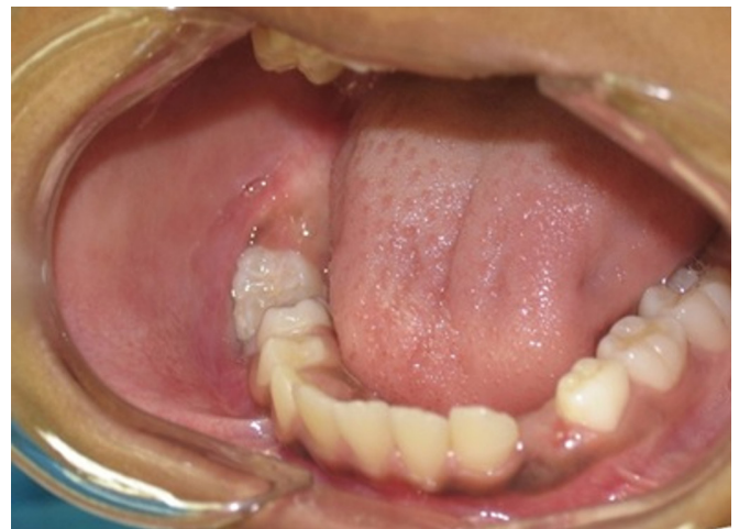
Figure 1. Intraoral examination revealed a mild bulging in bottom lower right buccal vestibule in the region of the first permanent molar and dental units 45 and 47 in infraocclusion.

On extraoral examination there was no clear asymmetry of the jaw. However, the intraoral inspection revealed a mild bulging in bottom lower right buccal vestibule in the region of the first permanent molar. The 45 and 47 dental units were in infraocclusion (Figure 1). There was no paresthesia or pain over the lower lip. Patient and their mothers' reported no history of local trauma.