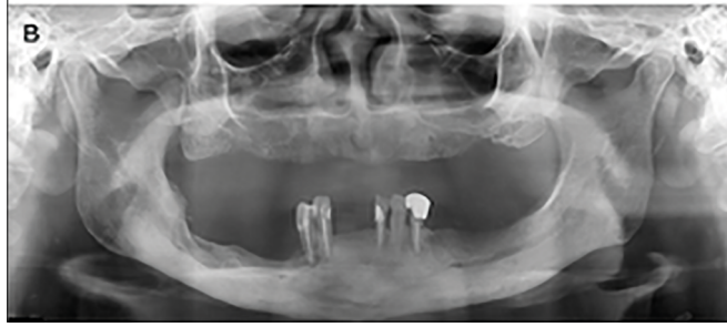
Figure 3. A- Panoramic reconstruction from an immediate post-surgery computed tomography showed the presence of regulated bone margins and no fragments of necrotic bone in the right mandible body. B - At a two-year panoramic radiograph follow-up, sclerosis of the mandibular bone – neoformed bone – with no signs of osteolysis or sequestrum could be observed.

poor oral hygiene, actinomyces infections and tissue manipulation<sup>1-6</sup>. Patients receiving oral BPs such as alendronate, for osteoporosis also are at risk for developing MRONJ, especially when the duration of the therapy is longer than four years, however, it seems less-likely to occur than those treated with IV antiresorptive therapy<sup>1</sup>.